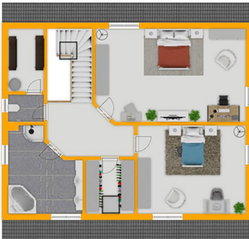
Exposéplan, nicht maßstäblich