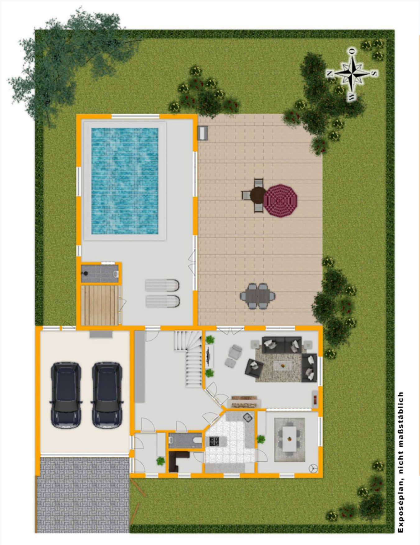
Exposéplan, nicht maßstäblich